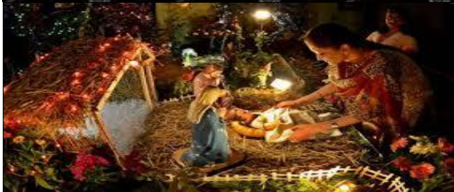
Christmas day celebration