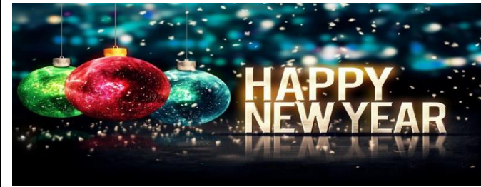
New Year Celebration