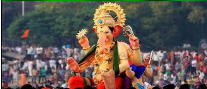
Ganesh Chaturthi celebration